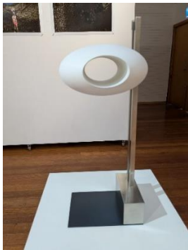
20 John Meade, Space Ellipsoid Mk II 2021

Solid nylon SLS 3D print, stainless steel, Dulux Weathershield acrylic paint, auto enamel 48 x 13.5 x 18.5 cm $9,500.00