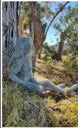
Kylie Pollock Meraki 2025

Meraki , a Greek word describing the ability to wholeheartedly imbue something of yourself. The artist has used wire to articulate her presence. The wire is melted, cast, cooled, heated, rolled, stretched, and wound. Some of the same forces formed and re-formed our earth. This work connects the viewer to the Earth