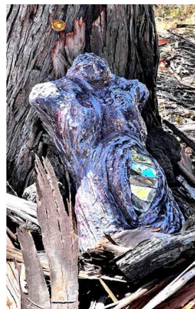
Deb gARTland The Motherhood Mirror 2025

This work symbolizes mothers as reflection of those around them. Viewers are encouraged to look into The Motherhood Mirror and to (gently) touch the wax while reflecting on their interpretation of the artwork. Medium: Encaustic wax and mixed media Price: $2,100.00 + GST