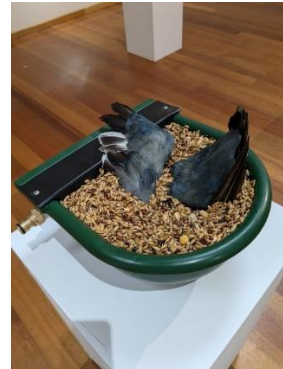
33 Yusi Zang Feeding #2 2025

Bird feed, synthetic pigeons, resin, bird feeding trough $3,090.00