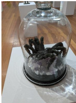
21 Simon Normand, Shelob's treasure 2025

Bronze with amethyst encrusted base in glass bell jar. Artists proof 20 x 20 x 30cm $3,080.00