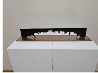
16 James Geurts, Dissonance: Tidal Intervention 2025

Bronze (available as wall mounted) 80 x 30 x 9cm Edition of 6 +1AP $6,380.00 T