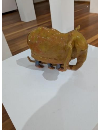
24 Geoffrey Ricardo, Elephantish

8 x clear acrylic panels with acrylic paint: violet sea snail, sea lettuce green, old shell fragment teal, bull kelp brown, cart-rut shell egg-casing pink, violet sea snail purple (light), sea grass green, kelp gold 40.5 x 56.5 cm $18,000.00 Edition of 3