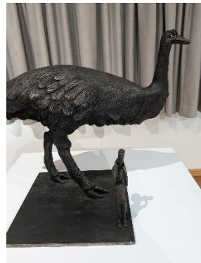
22 Simon Normand, Looking for the dark Emu 2025

Bronze with inlaid crystal eye 45 x 50 x 30 cm $6,600.00