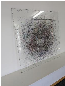
29 Chaohui Xie, Sovereignty 2023

Digital print within clear laminated glass 120 x 120cm x 10mm $4,500.00