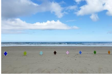
23 Kerrie Poliness, Landscape painting Lorne, violet sea snail purple (dark) 2025

8 x clear acrylic panels with acrylic paint: violet sea snail, sea lettuce green, old shell fragment teal, bull kelp brown, cart-rut shell egg-casing pink, violet sea snail purple (light), sea grass green, kelp gold 40.5 x 56.5 cm $18,000.00 Edition of 3