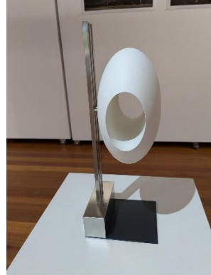
19 John Meade, Space Ellipsoid Mk III 2021

Solid nylon SLS 3D print, stainless steel, Dulux Weathershield acrylic paint, auto enamel 41 x 13 x 14.5 cm $9,500.00