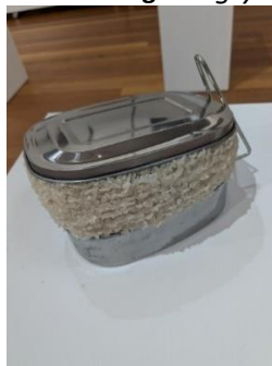
30 Yusi Zang Hungry 2024

Stainless steel lunch box, rice, PVA 13 x 25 x 9 $1,230.00