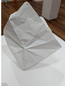
17 Anne-Marie May Untitled ..closely tracing movement 2021

Unique state bronze, cast from paper maquette, patina and acrylic paint 12.8 x.14 x 12 $11,000. 00