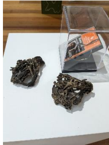
27 Jen Valender, Silence (song) 2019

Bronze cast analogue magnetic tape, bronze cast Port Phillip Bay codium galeatum , (can repair itself if damaged), cassette tape (Kamahl, Save the Oceans of the World). $6,000.00