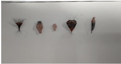
26 Meaghan Shelton Naissance 2022

Crocheted recycled copper wire Dimensions variable, but group approx. 55 x 100 $3,900.00