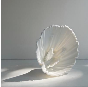
32 James Geurts, Superposition 2025

Bronze, for commission. Scale model 3D print in acrylic on display 24 x 24 x 14.5cm Edition of 6 +1AP $8,580