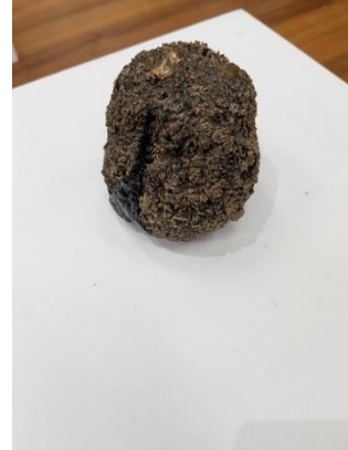
28 Jen Valender Lacuna 2025

Bronze, sea sponge, Dulux aquanamel 8 x 8 x 11 cm $6,000.00