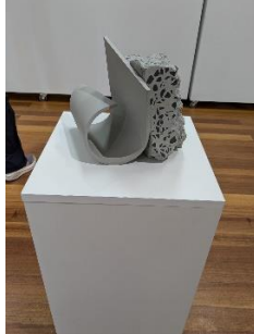
15 Carly Fischer, Slip !! 2023

Concrete and basalt aggregate, ceramic, acrylic paint 23 x 30 x 24 cm $1,570.00