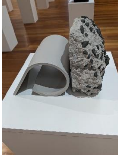
14 Carly Fischer, Slip !! 2023

Concrete and basalt aggregate, ceramic, acrylic paint 30 x 20 x 20 cm $1,570.00